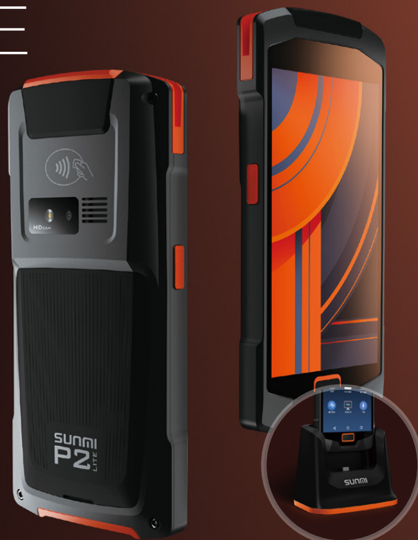
Optional single stand charger